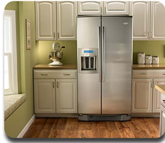
High end refrigerator