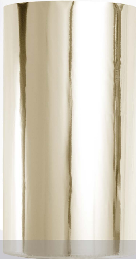
Silicon oxide film