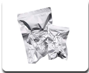
Food vacuum packaging